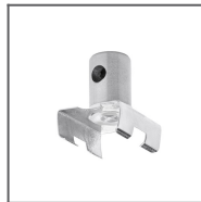
ST Head Ref: 42216