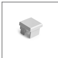
M-K grey End cap Ref: 24216