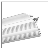
LIT-L Profile Ref: 18033