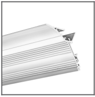
LIT-L Profile Ref: 18033