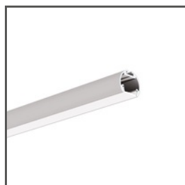
OLEK A08505 Ref. arch B8505