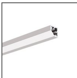
KUBIK-45 A07697 Ref. arch B7697