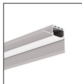
KOZUS-CR A00600 Ref. arch C0600