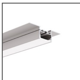
GIZA-LL-UST A02724N Ref. arch C2724