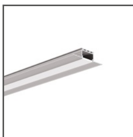
KOZUS A07823 Ref. arch B7823