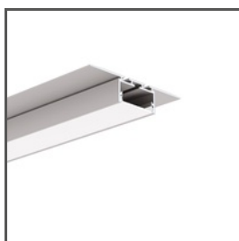
GIZA-LL-T A02479 Ref. arch C2479